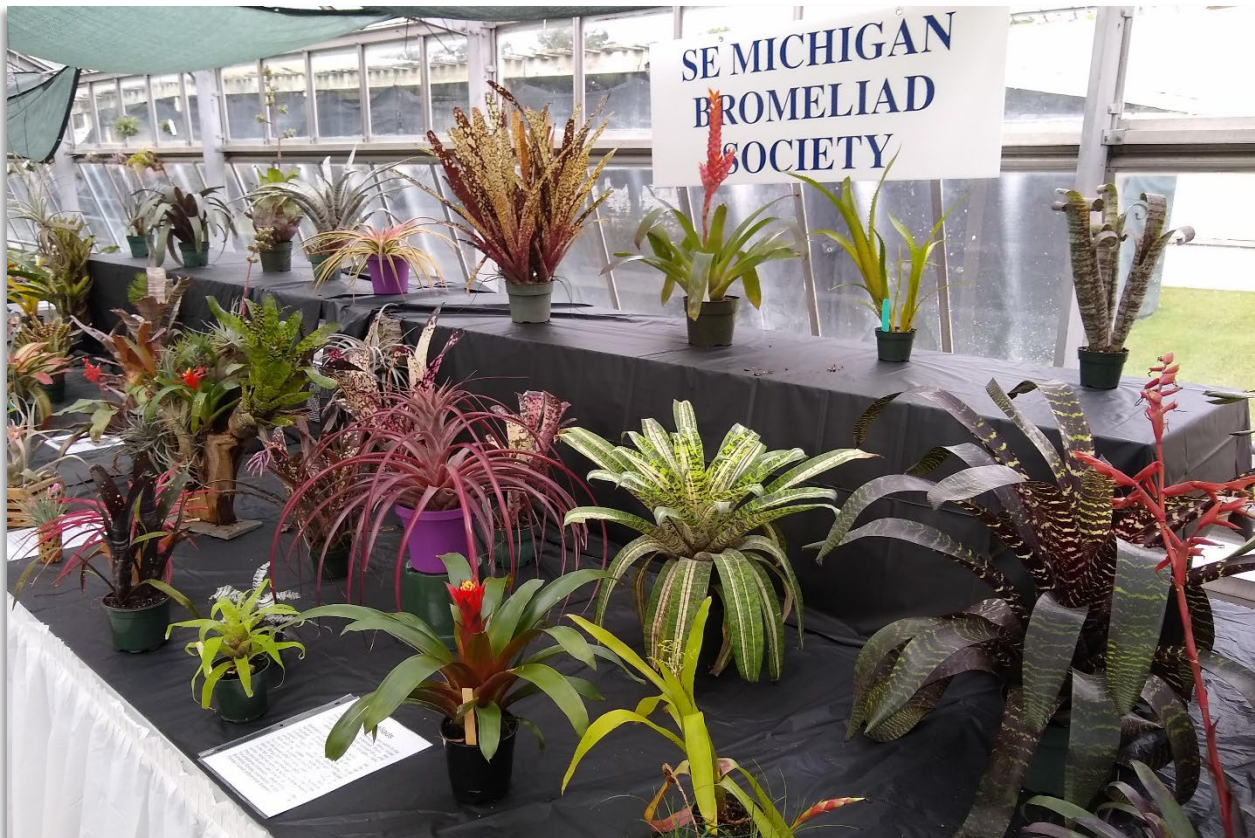
A portion of the SEMBS Display from the 2019 Show at Matthaei Botanical Gardens

An Affiliate of the Bromeliad Society International September/October 2022