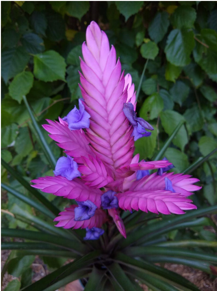
X Wallfussia 'Creation.'