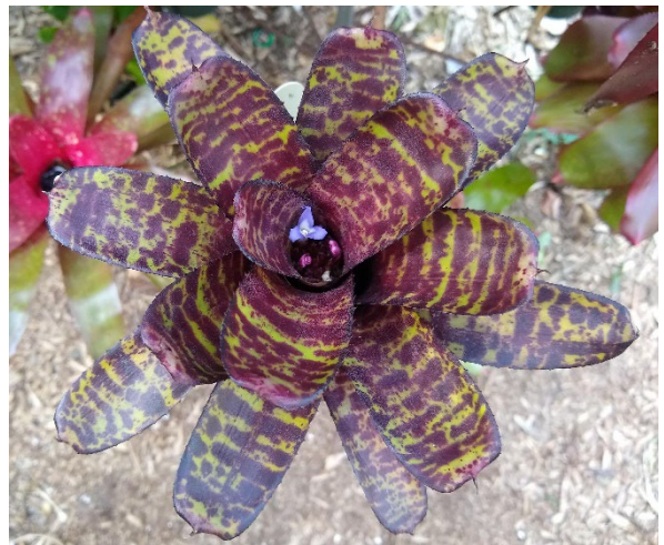
Neoregelia 'Massasauga' x 'Sorcerer's Apprentice'.