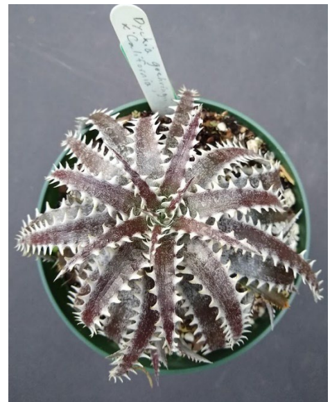
Dyckia goehringii x 'California.'